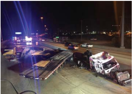
caused traffic to stop from 3pm Sunday for at least 5 hours in the westbound lanes, and for a shorter time in the eastbound lanes. Authorities believe the driver, who was uninjured, may have fallen asleep and missed the curve.