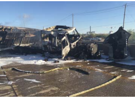
Firefighters from Highlands, Channelview, and Baytown were busy last Sunday, fighting a fire that consumed this semi-truck after it crashed into a guardrail, jackknifed across all 3 lanes of the I-10 highway over the San Jacinto River, and