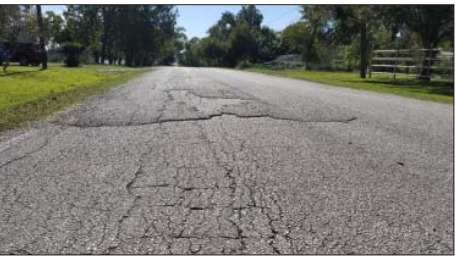
Road improvements in Lynchburg area.

LYNCHBURG, Texas – Commissioner Jack Morman announced the start of construction on a new BetterStreets2Neighborhoods (BS2N) project for late November along various roadways in the Lynchburg area. BS2N is a Precinct 2 program dedicated to preserving asphalt roadways by restoring the base and overlaying it with new asphalt to create a brand new, smooth riding surface. This $1.4 million project will utilize the full-depth reclamation technique, a multi-phased process that recycles the asphalt pavement and integrates a cement slurry to produce a stabilized base for the roadway. This in-depth method is most commonly used on asphalt roadways that have reached the end of their useful life. The roadways to be improved are: Center Street, Lakeview Drive, Kilgore Avenue, Oakland Street, Burnett Street, Ilfrey Street, and Maple Street. Residents will have access to their homes at all times, and mailing services are not to be impacted during construction. Traffic patterns may shift during construction, so drivers are urged to be mindful of signage and flaggers when travelling through work zones. Construction is expected to be complete in the second quarter of 2019. Be sure to visit www.hcp2.com or like the "Harris County Precinct 2" Facebook page for more information on the Precinct.