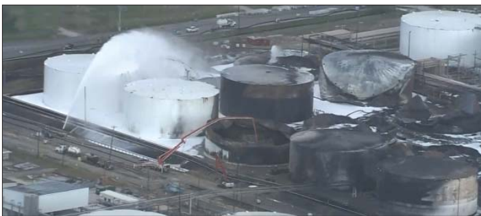
CLEAN-UP continues at the ITC site in Deer Park. In this photo, taken over a week after the fire, foam is being sprayed to seal tanks, and a pump truck at center is removing chemicals that still pose a hazard.