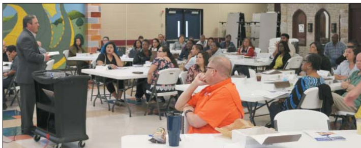
The bond proposal was developed and recommended by the Citizens' Bond Planning Committee (CBPC), a diverse group of CISD parents, staff, local citizens, and community leaders.