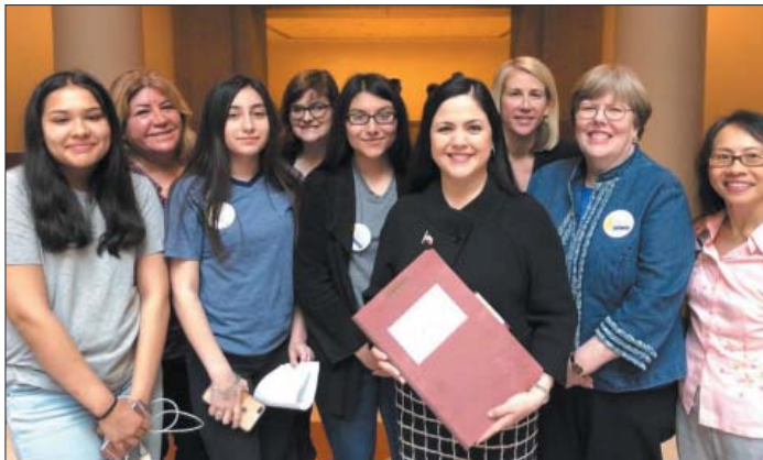
Rep. Hernandez with students and supporters after presenting House Bill 1602 to the House Committee on Public Education

Dear Friend, With less than seven weeks remaining in the 86th Legislative Session, the Texas Capitol is growing increasingly busy! Committees are meeting twice a week, major pieces of legislation have passed at least one chamber of the Legislature, and negotiations on major policy topics such as property tax reduction, public school fi-