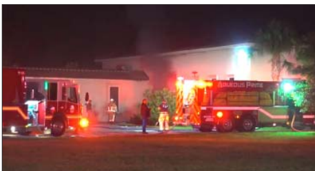
Firefighters combating fire at Foreman’s house one managed to get out safely. We don't know if Foreman was home himself or who saw the fire and called 911. Foreman sent out a tweet after the fire writing, "Don't worry all is well. Dogs are barking and I don't mean my feet. Thanks to all the firefighters. Huffman, Houston, New Caney, Atascocita."

HUFFMAN, Texas – The Harris County Fire Marshal's Office is investigating a fire that broke out at former professional boxer George Foreman's home last Sunday night in Huffman. According to officials, the fire began in the garage, reportedly in a golf cart by the back wall. Crews were able to keep it from spreading to the rest of the home. There were at least 40 vehicles in the garage, where the fire started, but none of them were damaged. There were people inside the house at the time of the fire, but every-