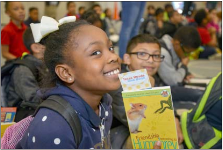
Galena Park ISD students participate in Texas Reads One Book program.

On Monday, April 15, Galena Park ISD third graders joined Dallas Cowboys head coach, Jason Garrett, as he kicked off Texas Reads One Book with his videotaped reading of the first chapter of Friendship According to Humphrey. Every student received their own copy of the book to read at home or in the classroom. Galena Park ISD encourages families to pick up where Coach Garrett left off, reading a chapter from the book each night. There will be daily trivia questions, discussions, and other activities in the classroom to ensure that reading takes center stage in the home, school and community throughout the duration of the program. The Texas Reads One Book program's goal is to encourage family involvement in the reading process and boost student engagement with books.