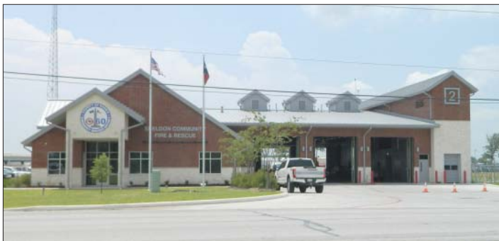
NEW SHELTON FIRE AND RESCUE STATION #2, as seen from US90 Old Beaumont Highway.