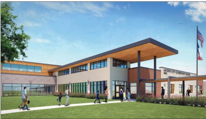
ARCHITECTS RENDERING: VLK architect's rendering of the future Jacinto City Elementary School.