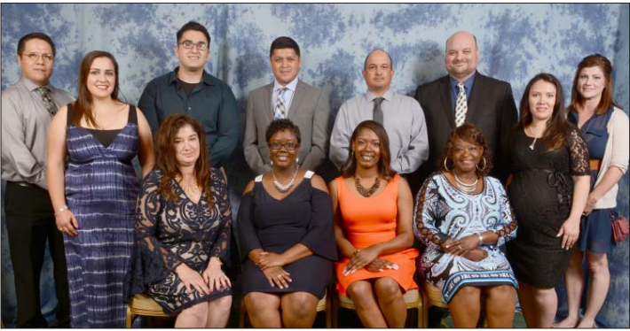
Channelview Independent School District honored Teachers of the Year during the 2019 CISD Celebration of Excellence.