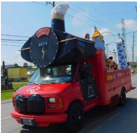
Parade Results: Best in Show as depicted at left: First Place Crosby High School's Theater Group with the Hogwarth Express, 2nd Place Star Steppers, 3 Crosby High School Cheer Team Best Western Heritage wagon or Trail Ride Trail went to Southeast Texas Cowboy Church, Second place went to Cow Punchers and Crosby Community Center had third place.