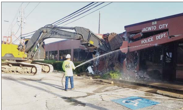
10429 Market Street Road, JTB Demolition workers demolishing Jacinto City's 70 year old police station. A new two-story facility has been built there that's now in operation by the city's police force.

Current and former city officials gathered to witness the demolishing of the 70 year old police station that's had fewer than 10 police chiefs run the department. As the demolishing began some present started going down memo-