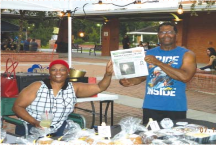
Read a North Channel STAR while you buy your cupcakes and baked goods. At Thankful.