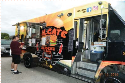
Sliders and more from the TailGate food truck.