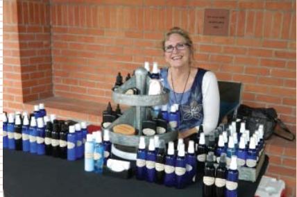
Get essential oils, mustache wax and more at Backwoods Essentials.