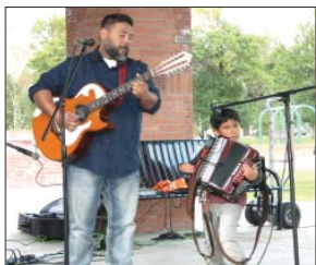
Never too young for accordian music.

Halloween displays also were a theme as October 31 approaches, with yard decorations and table displays available.