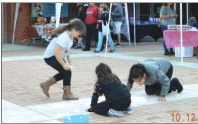
Chalk drawings were a popular art activity for the young.