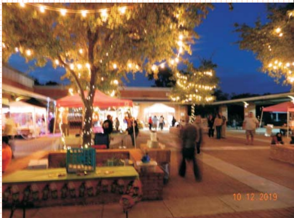
CROWDS ENJOY THE FESTIVE LIGHTS AS DARK FALLS