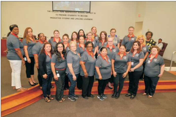
In recognition of National School Lunch Week, Galena Park I.S.D. (GPISD) Board of Trustees recognized our Student Nutrition Department and the campus cafeteria managers at the October Board Meeting. National School Lunch Week is observed October 14-18 across the country. The National School Lunch Program is dedicated to the health and well-being of our children and has been joined through the years by many other feeding program. GPISD would like to thank the Student Nutrition Department and all of the campus cafeteria employees for everything they do!