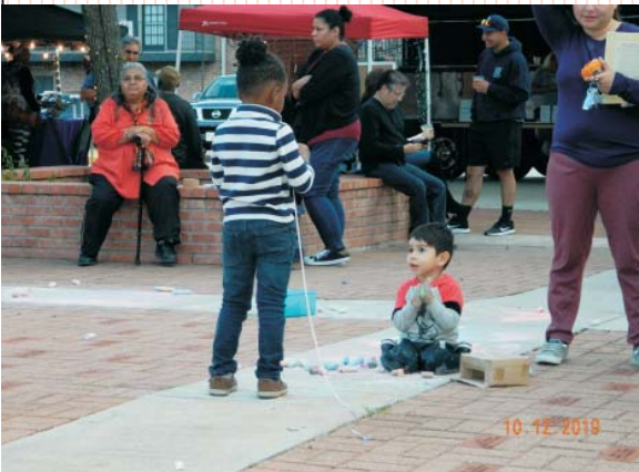
TO DRAW WITH CHALK - OR NOT. DECISIONS.