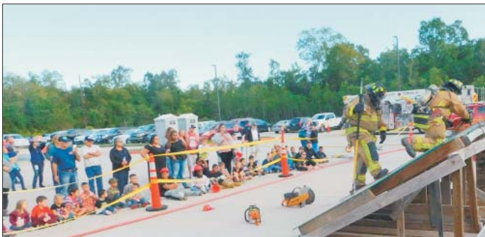
Firefighters above demonstrate how to Vertical Vent, a tactic used to exhaust hot gases trapped within a burning building.

Future firefighters listen intently as law enforcement and firefighters tell them about the Smoke House, a display that teaches kids how to find their way from a blazing building and escape without getting burned. And there is climbing involved. You have to listen to know what to do some part of being a good recruit firefighter is listening to instructions. Harris County also brought in some experts to involve kids. The fire house offered frito pie and chili dogs to the kids and many got to sit inside a real fire truck.