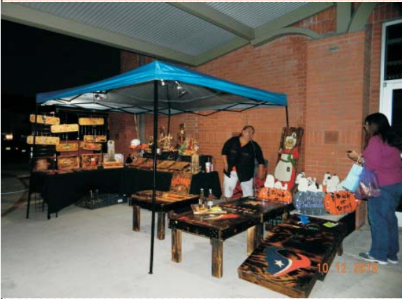
HALLOWEEN YARD SIGNS AND DECORATIONS