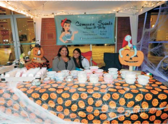
HALLOWEEN SCENTS TO KEEP GOBLINS AWAY