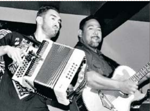
LIVE MUSIC BY GRUPO INVICTO