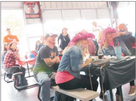
There were prizes for best hats and everyone knows when your horse is winning.

CROSBY – The Crosby-Huffman Chamber of Commerce hosted a “A Nite at the Races” at the Crawfish Shak last Saturday featuring some Mexican delights rather than the worlds greatest Cajun cuisine as normally found at this restaurant during season. The event was to raise funds so that the community business based organization could be financially enabled to continue representing Crosby to the extended business community. Crosby continues to recover economically from the hurricane and flooding events.