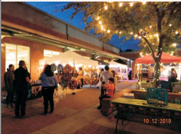
JACINTO LIBRARY AT LEFT IS ONE OF THE DISPLAYS