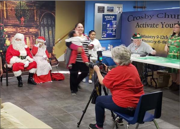
Off the beaten path, kids got their photo with Santa at the Crosby-Huffman Chamber of Commerce Christmas Festival of Lights last Saturday at a new venue, Crosby Church. This year, the event was held on the first weekend of December as it will next year. Lines were not nearly so long for Santa this year as last.

Bounce Houses were spaciouly placed around fire trucks so kids could enjoy running form one to the next with visions of sugar plums in their heads. All but the tiny ones in strollers got to jump and climb and play all day as the festival went on until about 4:00 p.m. on the campus of Crosby Church near US 90. All the activity lead kids to enjoy more hot dogs this year than last year's record number.