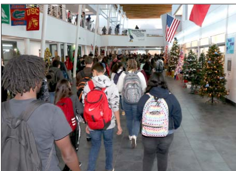
Trees, representing 59 clubs and organizations, line the main hallway, Main Street, of Goose Creek Memorial High School, giving the school a festive air.