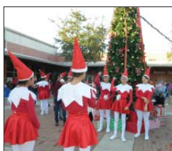
Elves brought color to the court.