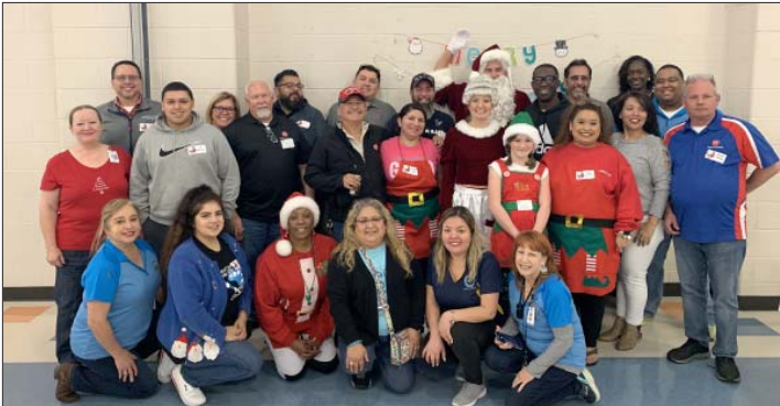
Channelview ISD staff members enjoyed participating in the holiday celebration provided by Groendyke.

Elementary students from Channelview schools received a special treat from Groendyke. Santa and Mrs. Claus arrived on a bright red Groendyke truck and brought gifts, games, and food was pro-