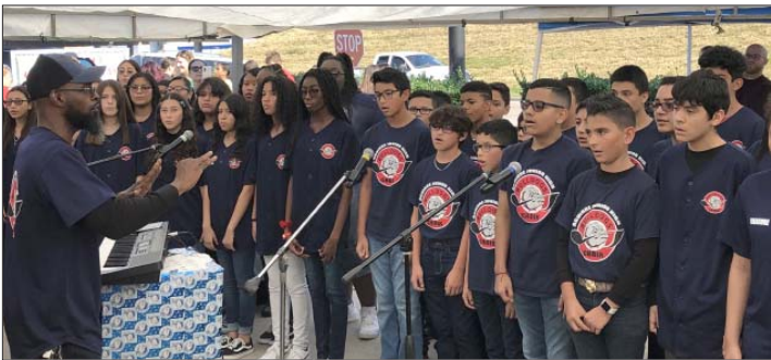
The choir from Anthony Aguirre Junior High entertained the crowd with musical holiday selections.

Channelview ISD partnered with the Channelview Fire Department for the 6th Annual Community Toy Drive on Saturday, December 7, 2019, at Panera Bread.