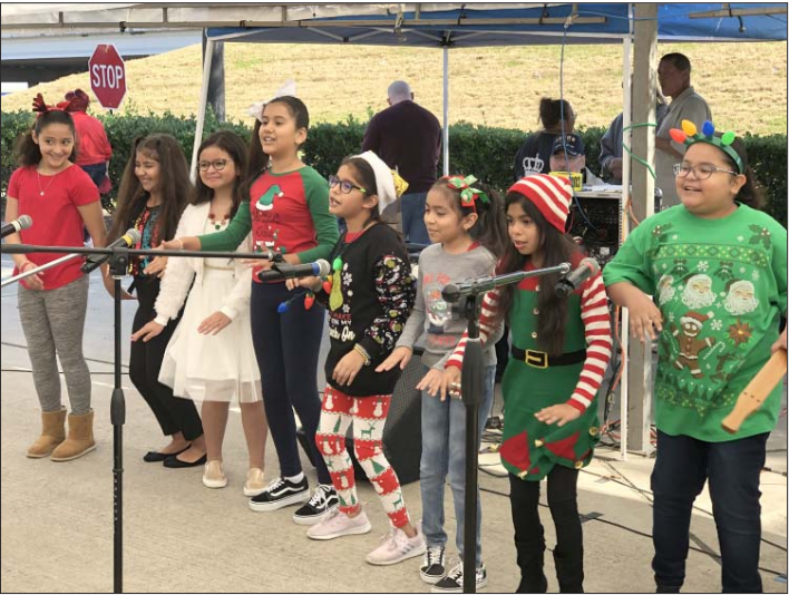
The Cobb Elementary Choir performed holiday songs for the crowd.

students collected toys for the drive. Corporate sponsors for this year's event were 24 Hour Safety, Arke-ma, Channelview Ministry Team, Huckabee, Inspire Church, LyondellBasell, Solar Turbines a Caterpillar Company, Southwest Shipyard, and Stewart Builders.