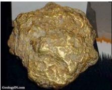
The largest gold nugget ever found in the U.S.A was found in Alaska and is named the "Alaska Centennial Nugget".

It was named the Centennial nugget because it was found on the 100th anniversary of the Klondike Gold Rush, which brought thousands of men north to Alaska in search of gold. Its discovery in 1998 shows that there is without a doubt lots of huge gold nuggets left to be discovered. They haven't all been discovered, not by a long shot! With the record high gold prices in recent years and the renewed interest in gold mining, there is a very good chance that more big gold nuggets will be found in the very near future.