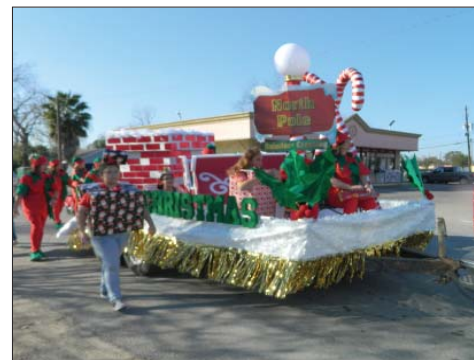
MANY DECORATED FLOATS WERE IN THE PARADE, WITH EITHER A HOLIDAY THEME OR A RELIGIOUS THEME. CHILDREN FROM LOCAL SCHOOLS RODE ALONG AND WAVED TO THE VIEWERS ALONG THE PARADE ROUTE.