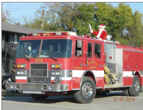
SANTA CLAUS WAS RIDING IN THE PARADE ON A SHINY FIRE TRUCK FROM THE JACINTO CITY FIRE DEPARTMENT. HIS APPEARANCE IS ALWAYS A HIGHLIGHT TO THE MANY CHILDREN THAT LINE THE PARADE ROUTE.