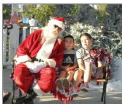
Santa was in the Park Pavilion, listening to little one's wishes

Jacinto City held its annual Christmas Parade and Tree Lighting last Saturday. Hundreds turned out for the event, held in beautiful weather. The parade was large, with 40 units displayed.