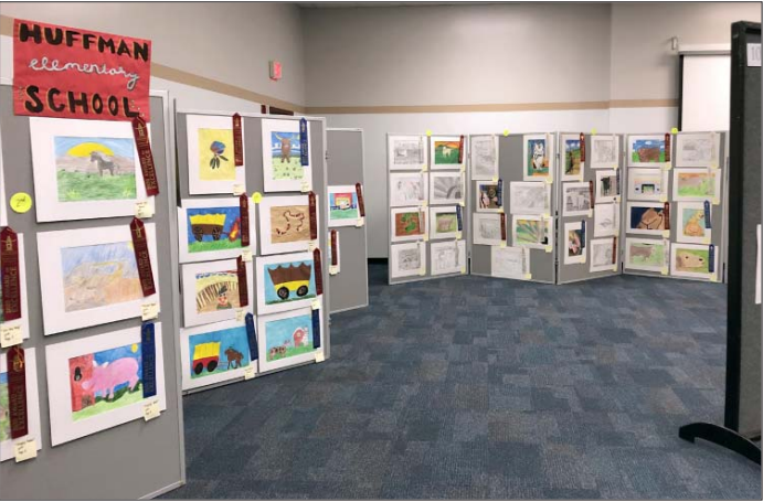
Setup has begun for the 2020 Huffman ISD Rodeo Art Show coming up on Thursday, January 16, 2020. This year’s theme is “Once Upon a Time in the Wild Wild West” the poster is being displayed by local supporters including Huffman Café, Los Compadres, Marsala’s Italian Café and Huddle House.

Wild West.” The event is scheduled for Thursday, January 16, 2020 from 5:30-7:00 p.m. at Huffman Elementary School, room 319. All family members and friends can celebrate these winning works along with the student artists. Winning entries will be on display at Reliant Center.