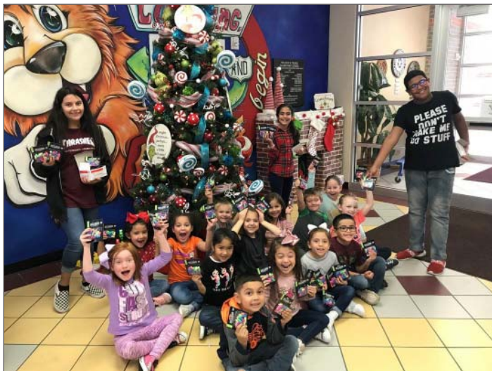
Travis Elementary students are excited about the supplies their school received from Walmart IDC 7042 right before the Christmas break.