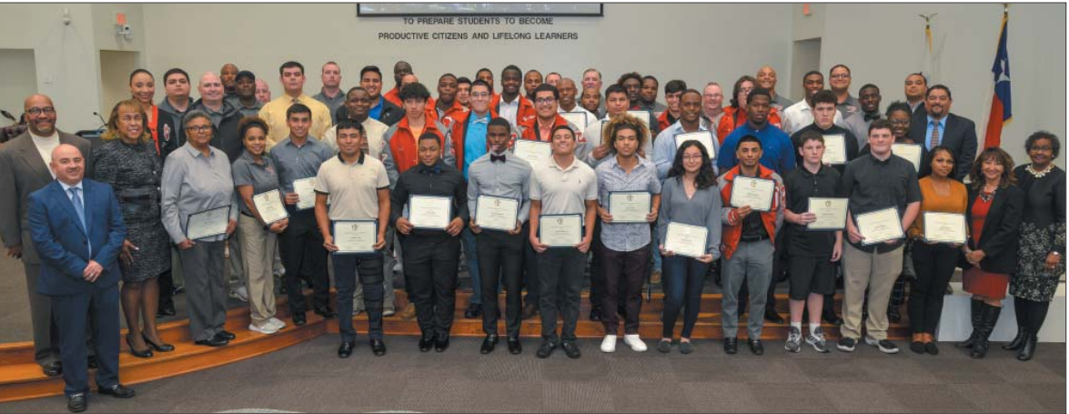
See Basketball Team, Page 8

The Galena Park I.S.D Board of Trustees recognized the North Shore Senior High Football team at the January Board Meeting. The North Shore Mustangs defeated the Duncanville Panthers 31-17 to be named the UIL Class 6A Division I State Champions. North Shore won its fourth state championship and have earned back-to-back state titles. The Mustangs were represented at the Board meeting by the senior team members, senior trainers, senior managers/video crew and the coaching staff. Galena Park I.S.D. will be hosting a community pep rally honoring the North Shore Mustangs on Saturday, February 1 at 3 p.m. at the Galena Park I.S.D. Stadium.