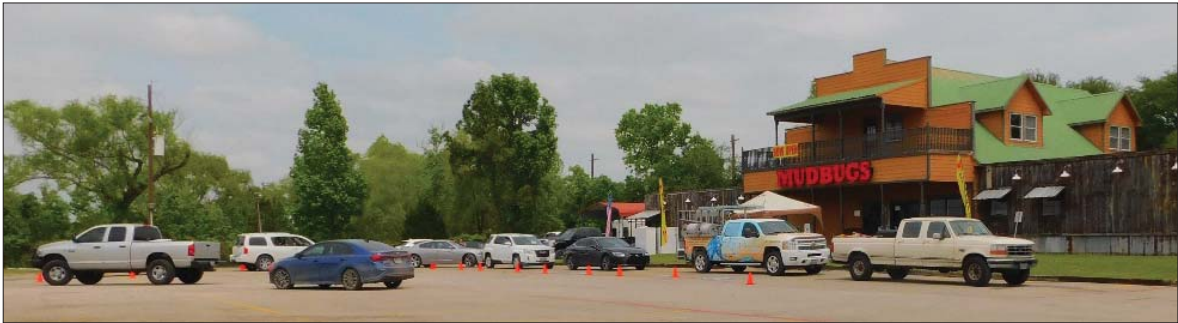
Mudbug Restaurant, the old Star Cafe, on FM2100 north sees long lines and happy patrons.