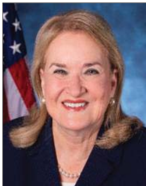
Congresswoman Sylvia Garcia

The Lone Star College System: $28.8 million with $14.41 million of the total amount