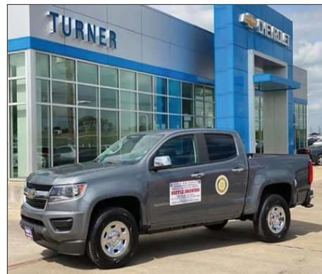
North Shore Rotary's top prize in their Annual benefit Fish Fry is this 2020 Chevrolet Colorado pickup truck, courtesy of Turner Chevrolet in Crosby.