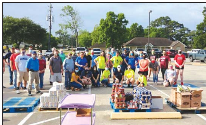
Volunteers who helped pack and distribute food bags pause for a group photo.

HIGHLANDS - With much of the population observing "Stay Home" rules, or temporarily without a job, food availability has become a major concern.