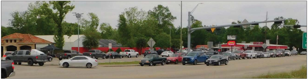
Crawfish Shack in Crosby usually has a long line of cars waiting for their order of delicious crawfish to go.