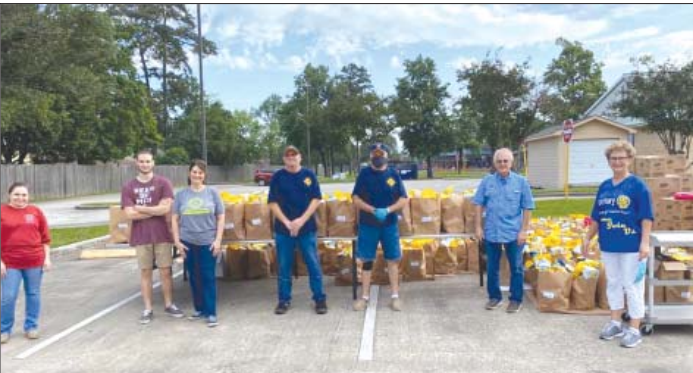
Observing "Social Distancing" these Rotarians toiled early in the morning to prepare Food bags for the Drive-Thru distribution last week at the Highlands Community Center.