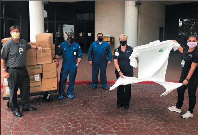
The first week of May, 2020, LyondellBasell representatives took protective personal equipment to Houston Methodist Hospital in Baytown.

Baytown, TEXAS (May 15, 2020) – With hospitals seeing shortages of personal protective equipment (PPE) around the country, LyondellBasell's Channelview Complex saw an opportunity to help those who help us all. The Channelview Complex donated more than 500 surplus protective coveralls it had on hand to Houston Methodist Baytown Hospital.