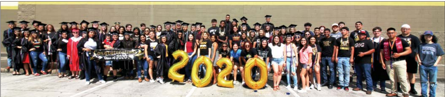
Graduating seniors from Galena Park and Furr High School line up after the parade for a photo. Tears flowed as caps tossed in the air when hugs and goodbye's were exchanged.