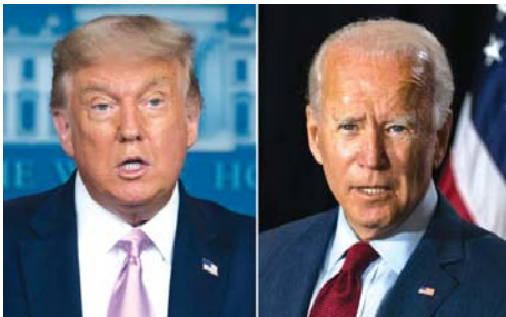
PRESIDENT DONALD TRUMP vs V.PRES. JOE BIDEN

U. S. Representatives that face challengers include Dan Crenshaw, Sheila Jackson Lee, Sylvia Garcia, and Brian Babin. All of these represent some part of