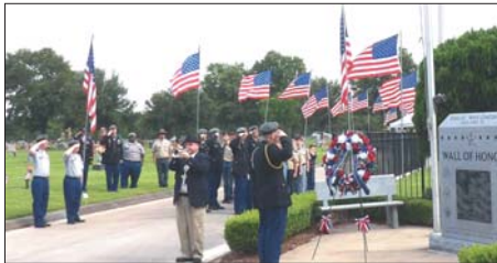
Solumn ceremony as the Memorial Wreath is laid at the Wall of Honor by Crosby JROTC at Sterling-White Cemetery in a day to remember those that served their country and those that made the sacrifice that others might have freedom.

of Little Country Church with campuses in New Caney and Crosby reminded all of the beauty of our country and the faith of David, who would become King from shepherd, his