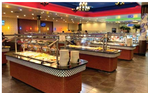
A large selection of various dishes are available on these islands, and a custom cooking section also has sushi and will cook your selection of meats to your taste. The buffet serves fresh seafood, and Chinese, American, Mexican and Japanese dishes all day long.

Due to the COVID pandemic, the buffet practices special health procedures. Besides cleaning and disinfecting all tables and seats between patrons, they require face masks to enter, have sneeze guards on all serving islands, and provide hand sanitizers and