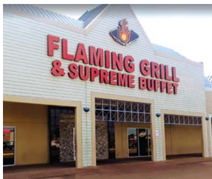
Flaming Grill & Supreme Buffet is located at 11420 E. Freeway Service Road, unit 150. Exit at Holland Road and proceed to the shopping center beside Tinseltown Theater. There is plenty of convenient parking.

Prices range from $11.99 for adults at lunch, and $13.50 at dinner, to $14.50 for the weekend specials. Children start at $5.99 for lunch and $6.99 for dinner. Senior discounts are available too.