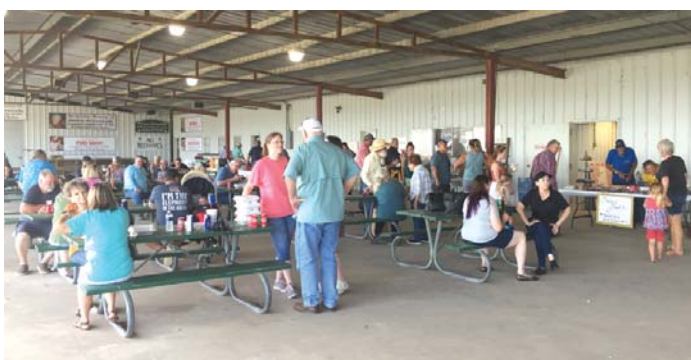
A LARGE CROWD ENJOYED THE MEMORIAL AND GOOD FOOD, WHILE THE KIDS PLAYED GAMES AND THE JUMP HOUSE.