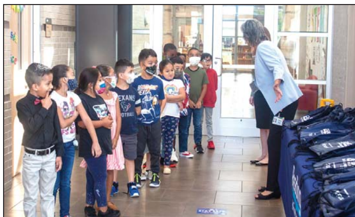
Second graders at Carroll Elementary School were surprised with backpacks and literacy kits from Reading is Fundamental and Macys. A small group of students were presented the kits and were able to distribute to fellow classmates on August 19.

The Sheldon ISD Education Foundation is a non-profit organization that exists to raise funds for teachers who apply for innovative teaching grants. Teachers can apply for funding annually by submitting an application for an idea, lesson or project they want to implement in the classroom. To date the Foundation has awarded approximately $121,000 in innovative teaching grants. To learn more, go to www.sheldonisd.com/sef/ .