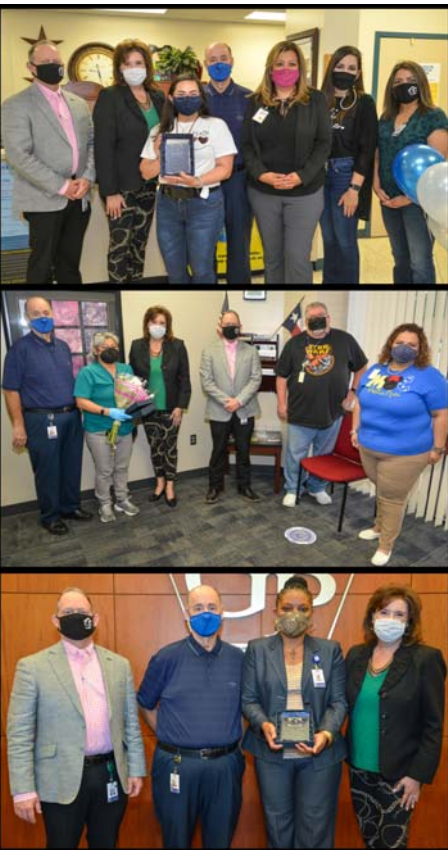
Galena Park ISD Education Foundation Name Winners of the Beyond the Book Award

The Galena Park I.S.D. (GPISD) Education Foundation seeks to acknowledge employees who go above and beyond their core duties to teach our students and support the delivery of education through the Beyond the Book Award. We believe those involved in the educational process should strive to support GPISD's standard of 'Excellence in All, for All, by All' in service to District stakeholders including students, fellow employees and community members.