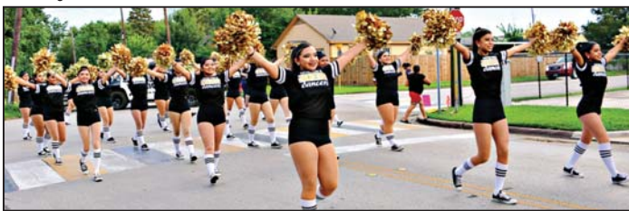
Winner best hallway decorating went to Jacketeer Dancers.