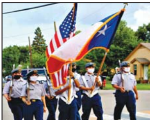
GP High School JROTC carrying the USA & Texas flags.