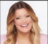
JAMIE KERN LIMA New York Times Bestselling Author Founder of IT Cosmetics