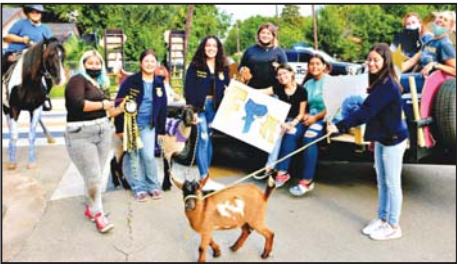
LEFT: Winner of best overall: FFA, students had goat, lamb and horse with their float.