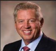
JOHN MAXWELL Leadership Expert and Bestselling Author

NORTH CHANNEL Simulcast Inspire Church Houston Friday, October 8, 2021 8 am - Noon