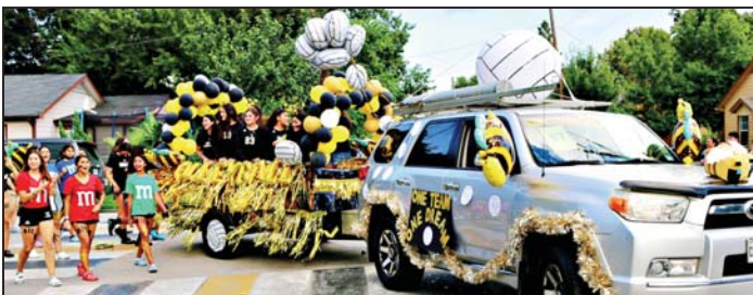
Winner of best float theme and decorations was the volleyball team. MORE PHOTOS ON PAGE 3.

speeches and band music. They watched the performances of the band, cheerleaders and Jacketeer Dancers.