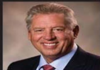
JOHN MAXWELL Leadership Expert and Bestselling Author

NORTH CHANNEL Simulcast Inspire Church Houston Friday, October 8, 2021 8 am - Noon