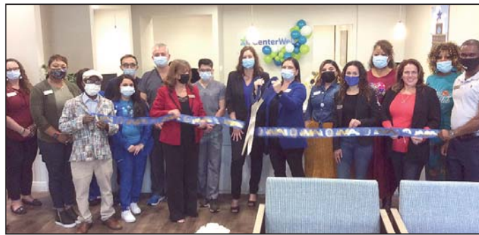
CENTERWELL SENIOR CARE RIBBON CUTTING

The North Channel Chamber of Commerce hosted Centerwell Senior Primary Care ribbon cutting on Friday, September 24, 2021 from 11am to 1pm. Centerwell Primary Care is located in Jacinto City at 1910 John Ralston, Suite 200, Houston, Tx 77013. Their name reflects their passion for improving the lives of seniors. Call 346-234-6393 for more information.