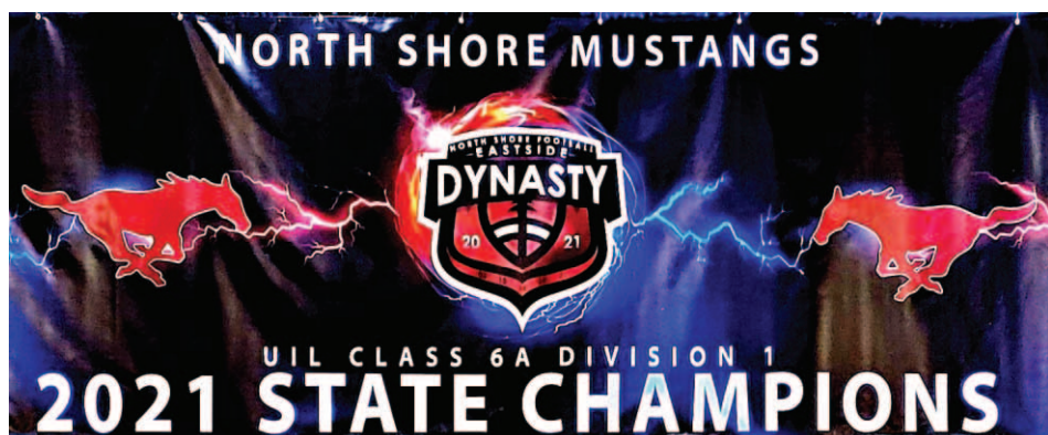
The display on the giant screen at the Bayou City Center where the North Shore Mustangs celebrated their State Football Championship title banquet.