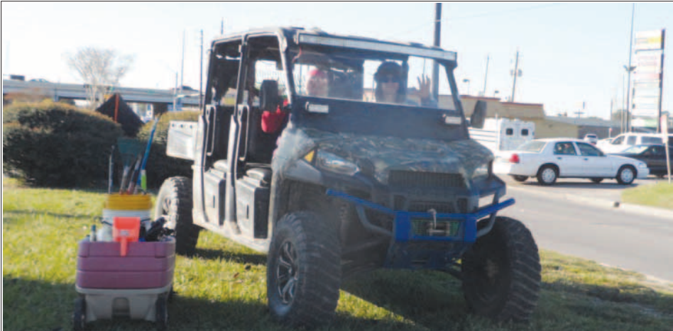
The right tools make the job easier and allow more area to be covered.