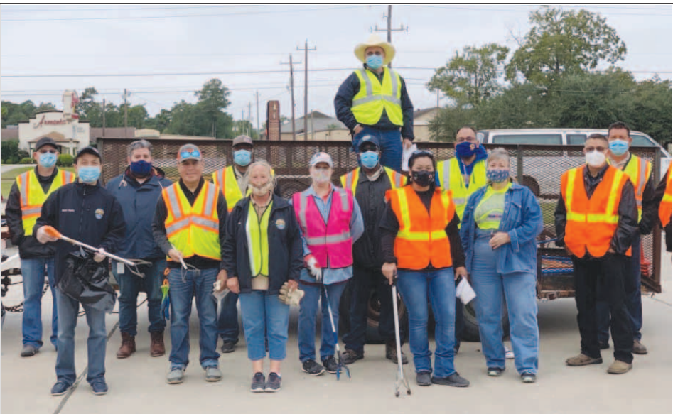
C.H.I.C. Sheldon Rd Cleanup partnering with Pct.2 group photo