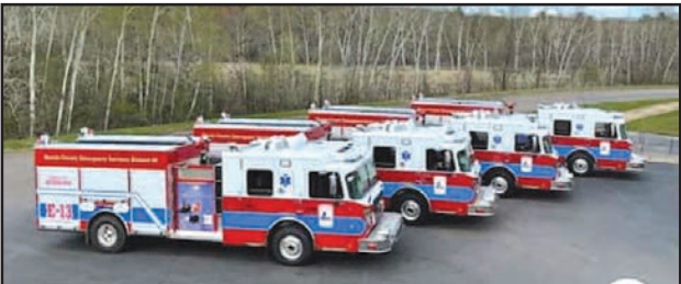
FOUR NEW SHELDON HIGH WATER FIRE TRUCKS