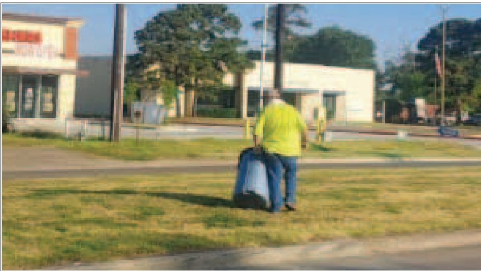
Cleaning the median near