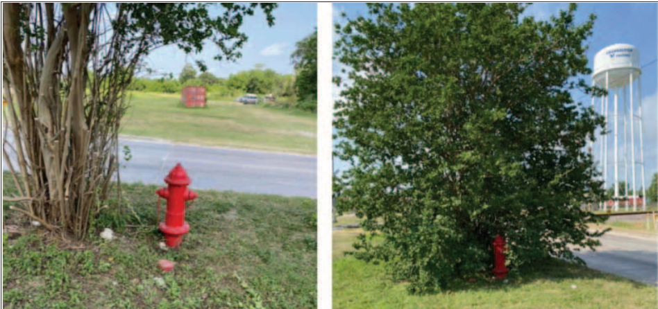
One of the two fire hydrants revealed during 05-21-22 Sheldon Rd. Trimming & Cleanup