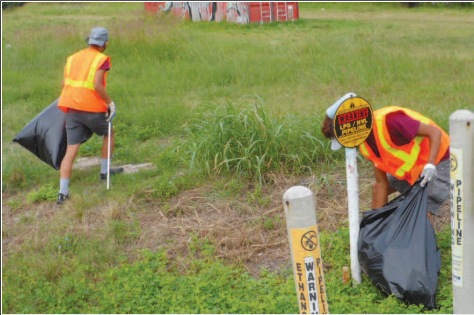
CVISD Interact students cleaning at the railroad tracks.

* December clean up is scheduled, but may be rescheduled or not be held due to the holiday season. Volunteers do not have to stay the entire length of the cleanup, participation of any length of time will be greatly appreciated. Please Wear Bright Clothing. Preferably Safety Yellow or OrangeShirts or Vests if you have them. Contact us at C.H.I.C.77530@gmail.com FaceBook: https://www.facebook.com/groups/892294181644780