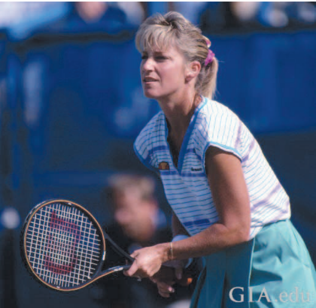
Chris Evert sporting her diamond tennis bracelet at the 1989 U.S. Open.

At the 1987 U.S. Open, tennis star Chris Evert was playing in a hotly contested game. She suddenly stopped mid-match and asked the officials for a time out. The reason: The clasp on her diamond bracelet had broken and the bracelet had fallen off her wrist, and she wanted to find it before playing the next point. When asked about it in an interview, she called the missing piece of jewelry her "tennis bracelet," and so the iconic name was born.