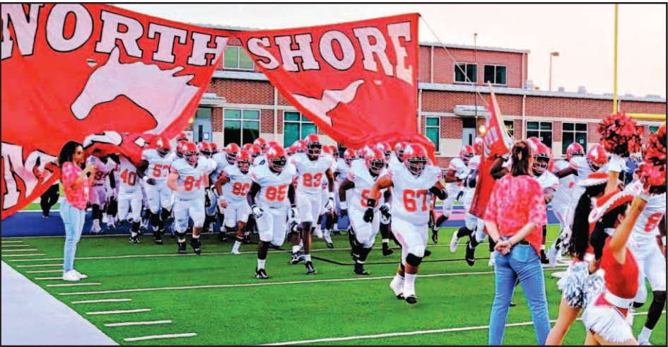
2021/2022 Reigning 6A Division 1 State Champion NS Mustangs take the field at the Beaumont ISD Memorial Stadium, September 23, 2022.