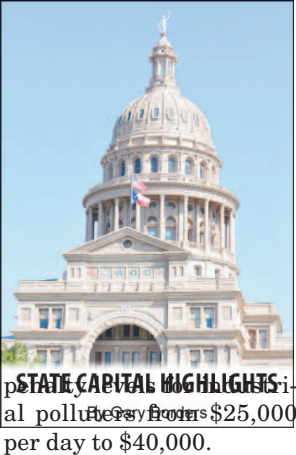
STATE CAPITAL HIGHLIGHTS: Editorial poll by Texas Press Association. Average pay: $25,000 per day to $40,000.