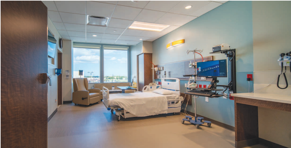
Typical Private Patient Room in the new Unity Tower.