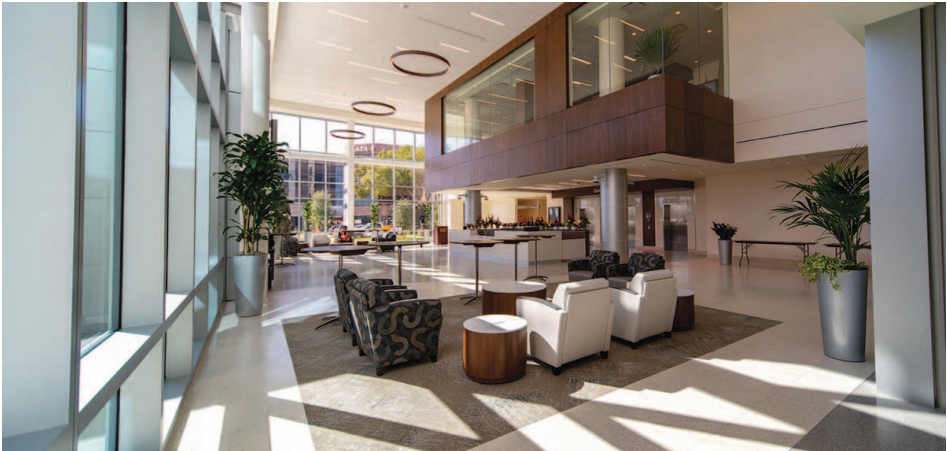
Lobby View of the new Unity Tower building.

program that has seen the opening of a new 5-story tower, emergency center, outpatient center and medical-surgical units. As a health care leader, the hospital is proud to have a fully integrated residency program focused on educating and inspiring future practitioners. Today, Houston Methodist Baytown provides the most advanced and innovative procedures while never wavering from its focus on compassionate care and providing a safe, patient-centered healing environment. Houstonmethodist.org/baytown .