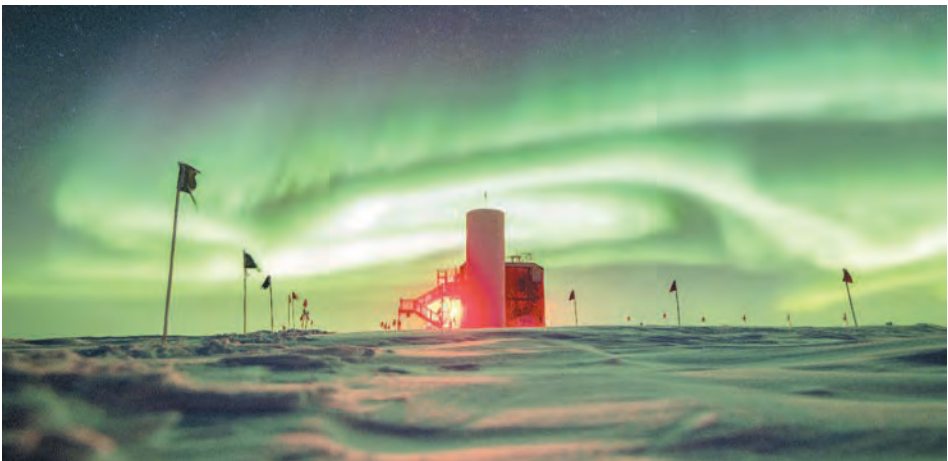
ICECUBE NEUTRINO LAB AND THE ATMOSPHERIC RESEARCH OBSERVATORY (ARO) RUN BY NOAA

See THE STARS AT NIGHT ARE BIG AND BRIGHT...FROM TEXAS TO THE SOUTH POLE, Page 7