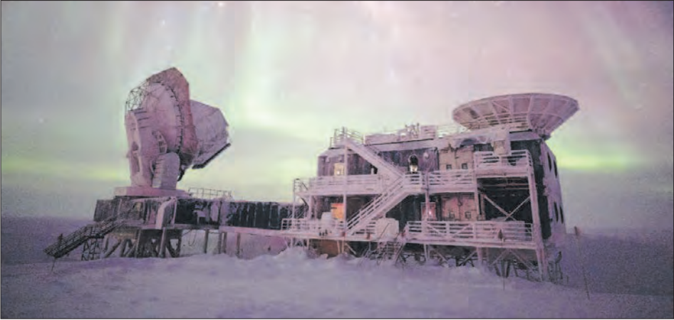
MARTIN A. POMERANTZ OBSERVATORY WHICH HOUSES THE BICEP ARRAY. THE 10-METER SOUTH POLE TELESCOPE (SPT FOR SHORT) IS HOUSED IN THE DARK SECTOR LAB (DSL) ALONG WITH BICEP 3.

temperatures are known to fall well below -80 with wind-chills dropping to -120 or lower. The coldest parts of winter can get well below -100. As many of us are complaining about our 103 + summer heat, these Texans are enduring -103 or colder. (YES, that's MINUS degrees folks!)