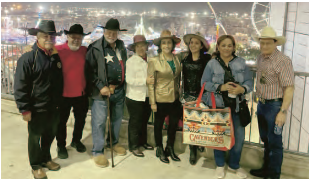
At the Houston Rodeo at NRG Stadium