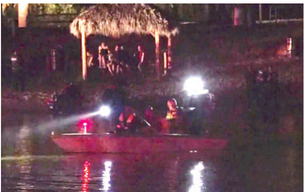
The Harris County Sheriff's Office Marine Unit searches Sunday night for the body of a man who apparently drowned while swimming in the river.

This is the second drowning incident this weekend in the same area. On Saturday, two children