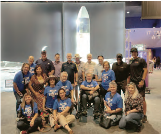
At NASA Flight Museum in Clear Lake