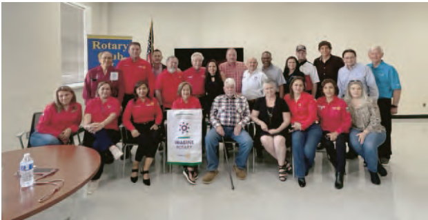
Rotarians from Torreon Mexico, and North Shore

North Shore Rotary Club has a sister club in Torreon, Mexico. In March of this year the North Shore club hosted a delegation from the Torreon club, with a dinner, and trips to the Rodeo, NASA, and other Houston sights. Here are some of the photos from that event: