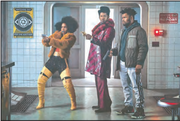
From left, Teyonah Parris, Jamie Foxx and John Boyega star in "They Cloned Tyrone."