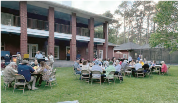
Enjoying a fine dinner together