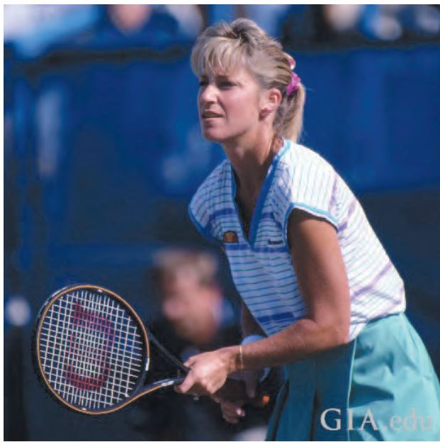
Chris Evert sporting her diamond tennis bracelet at the 1989 U.S. Open.