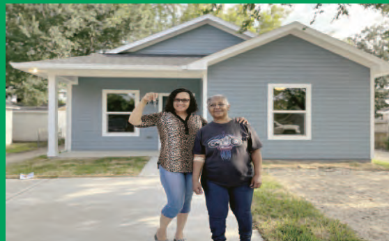
GLO has built 12,000 Homes in Texas since Hurricane Harvey. See Pages 2,4