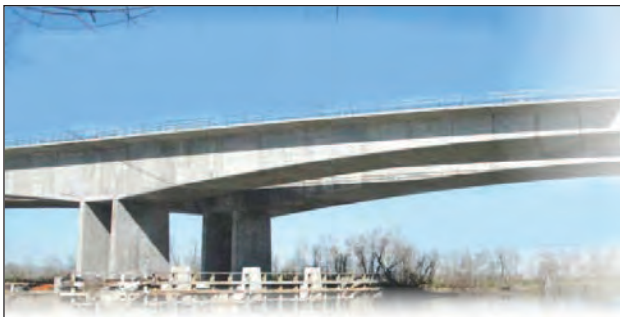
The new I-10 Bridge may be similar to this standard TXDOT design.

The purpose of the project is to improve traffic flow, increase navigational safety, and enhance roadway network connectivity within the project limits. The proposed project would replace the existing I-10 mainlane bridges over the San Jacinto River. The existing bridges have a 23-foot-vertical clearance and a 158-foot-wide horizontal navigational clearance. Due to repeated barge traffic collisions with the bridge structures on the San Jacinto River, the proposed I-10 mainlane bridge-