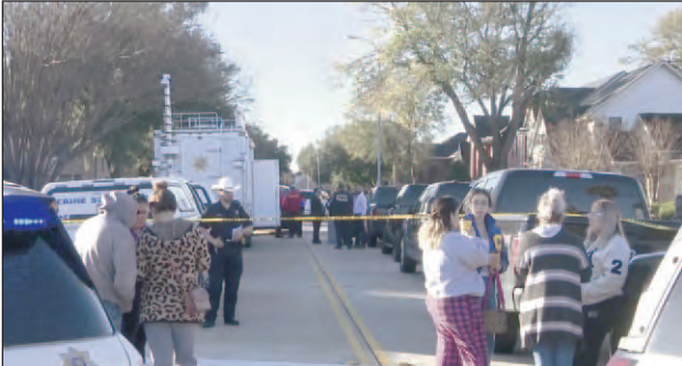
STREET SCENE on Black Walnut Drive after the shooting. Neighbors and Task Force Deputies gather to discuss the activity.

There were six other people, including women and children, inside the home during the shooting but no one