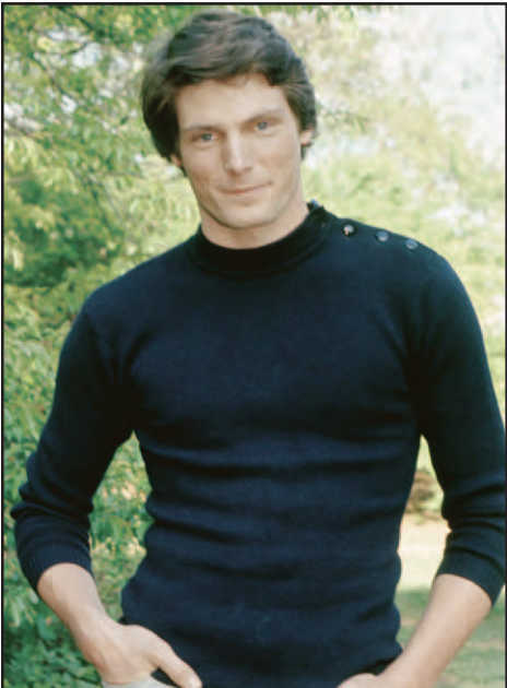
Christopher Reeve (“Superman”)

HOLLYWOOD — The children of four-time “Superman” Christopher Reeve bare their souls in a documentary commemorating the 20th anniversary of their father’s passing at the age of 52. The documentary follows his rise to fame through 1995, when he was thrown from a horse, breaking two vertebrae in his neck and leaving him paralyzed from the shoulders down. I met Christopher in 1976 when he played Katharine Hepburn’s grandson on Broadway in “A Matter of Gravity.” He also starred in the soap “Love of Life” and asked me to write a story on why he was leaving the soap. The photos and story ran in Soap Opera Digest, and I invited him to stay in my guest room in Hollywood if he ever needed to.