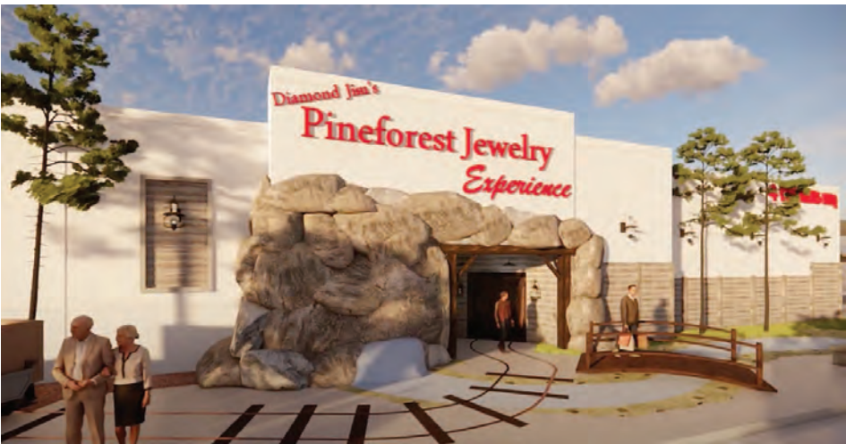
ARTIST'S CONCEPT OF THE NEW PINEFOREST JEWELRY "EXPERIENCE"

Holds Groundbreaking last Friday at site on Beltway 8