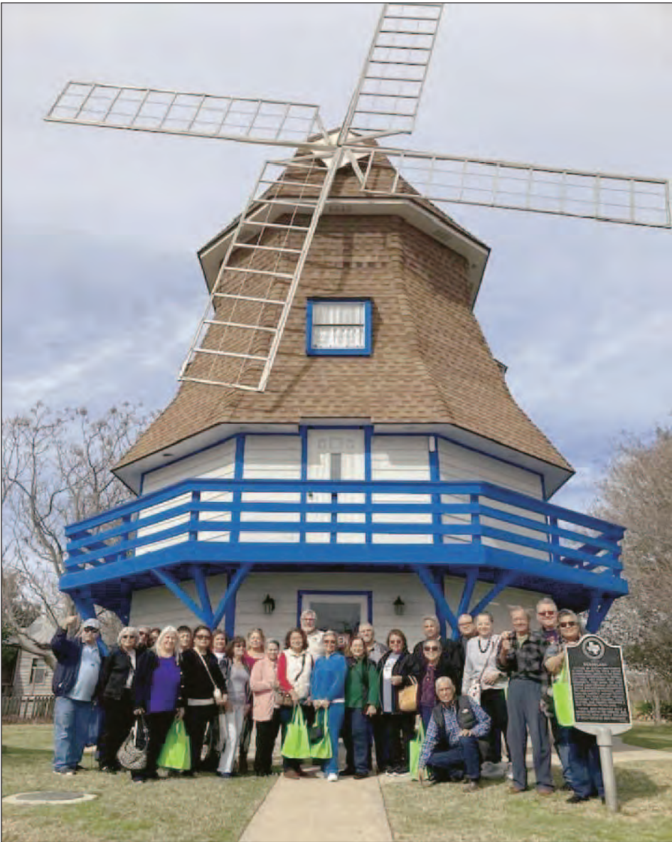
DUTCH WINDMILL MUSEUM and TEX RITTER PARK, Nederland Texas.