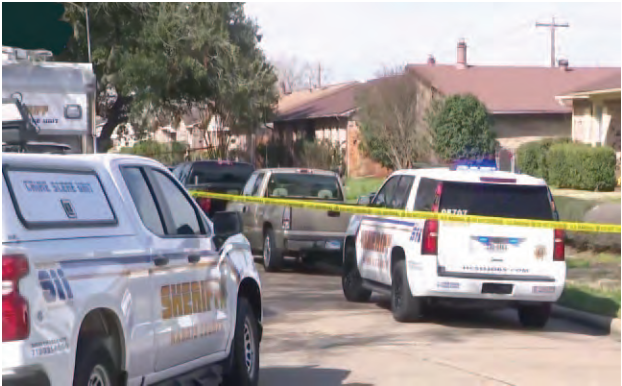
Scene of Fatal Shooting of Suspect by Task Force officers in an arrest attempt on Lourdes Drive in Woodforest last week.

He was wanted for charges out of Jackson