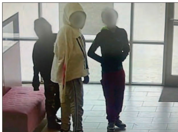
Dubbed the "LITTLE RASCALS" by authorities, the three young bank robbers are seen in a bank lobby camera.