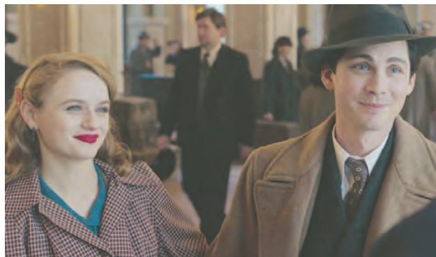
Joey King, left, and Logan Lerman star in "We Were the Lucky Ones."

on "Mr. & Mrs. American Pie" by Juliet McDaniel, Kristen Wiig ("Wonder Woman 1984") takes on the role of Maxine Simons. Maxine is a woman desperate to join high-society life in 1969 Palm Springs, California, after getting dumped by her husband and social circle. She sets her sights on the Palm Royale, an exclusive club whose elite members are dripping with glamour and vanity. But if she truly wants to get to the top of the Palm Royale, Maxine must sacrifice parts of herself to become the person she wishes to be. The series co-stars Ricky Martin ("The Assassination of Gianni Versace"), Laura Dern ("Big Little Lies") and the legendary Carol Burnett. The first three episodes are out now! (Apple TV+)