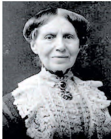
Clara Harlowe Barton, American Red Cross Founder Born, December 25, 1821 – Died, April 12, 1912

March 26, 2024 ~ Women's History Month is from March 1st. thru March 31st. ~ Clara Barton deserves recognition for her contributions as a battlefield nurse in saving lives and later establishing the American Red Cross. Contributions to this story came from hours of research from numer-