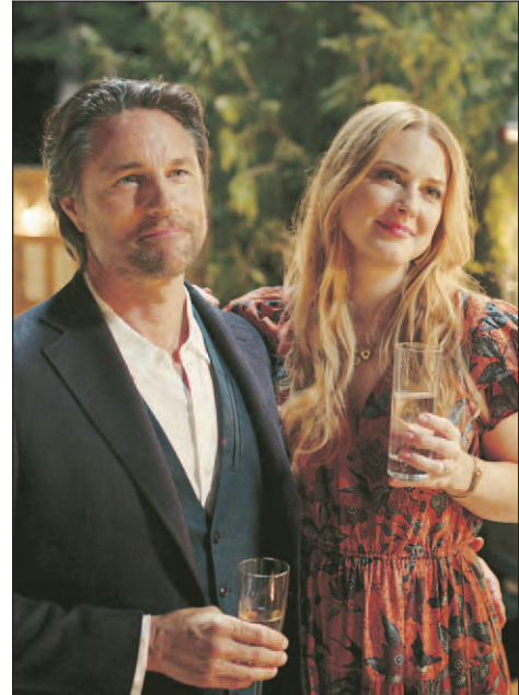
Martin Henderson and Alexandra Breckenridge star in "Virgin River."