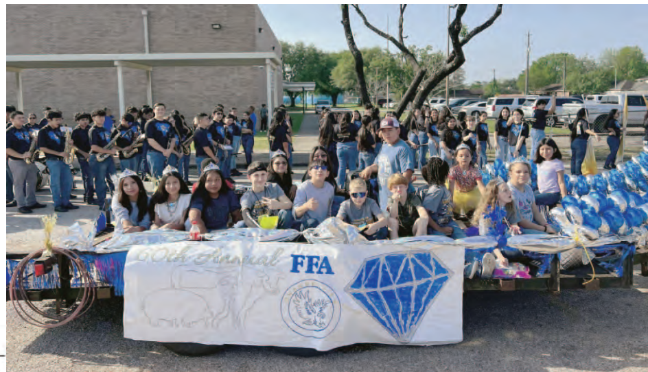
Last Year's Parade included this FFA Float and FFA members.

projects teach students about record keeping, responsibility, and endurance. Animal projects can be costly, from $500 for a rabbit, to $6,000 for a steer. Proceeds from the Show & Auction benefit exhibitors, and contribute to the scholarship fund. Buyers are welcome, and can contact the Ag Department at 713-447-4808 for more information.