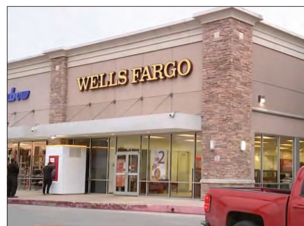
Wells Fargo bank that was robbed, on the North Freeway in the Greenspoint area.

Continued. See CHILDREN ROB BANK, Page 6