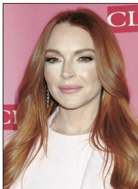
Actress Lindsay Lohan ("Irish Wish")

"Superman Returns" Brandon Routh joins Faye Dunaway, Harvey Keitel, Andrew McCarthy, Mena Suvari and Cheech Marin in "Fate The Movie." Brandon plays a firefighter. I met him when he was a waiter at Lucky Strike, a bowling alley at the Dolby Theatre. He quit to become Seth Anderson in "One Life to Live" (2001-02).