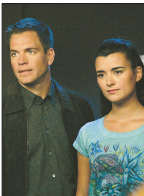
Michael Weatherly and Cote de Pablo to star in "Tony & Ziva"

Despite the disappointing conclusion to that romance, the season itself was a hit with many questioning who would be the first Golden Bachelorette. There was a recent report that "All My Children" star Susan Lucci was asked to be the chooser, but a spokesperson from ABC has denied it.