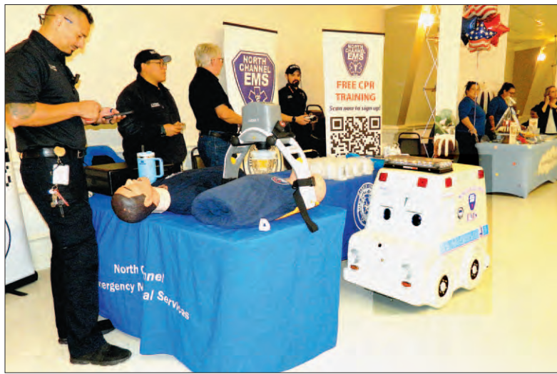
North Channel EMS demonstrated CPR techniques on the dummy, and entertained everyone with their Robot Ambulance.