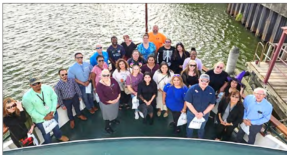
Thank you to everyone who was able to come out and join us for our annual M/V Sam Houston Boat Tour with Port Houston. To our member Port Houston for hosting us on this educational tour, we greatly appreciate you! We hope you enjoyed yourselves! Members Pictured: Port Houston, HCC-Northeast, McCord Development Generation Park, CenterPoint Energy, Hampton Inn & Suites Houston East Beltway 8, In Laws Services, LLC., Boy Scouts of America, Bay Area Homeless Services, Nothing Bundt Cakes, New York Life, LyondellBasell, HCP2, San Jacinto Battleground, Edward Jones, TX Agent Group, LLC. and Guests.