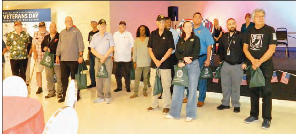
Veterans were honored at the Luncheon, and received a Gift Bag from the North Shore Rotary Club. After the luncheon, a bus took the Veterans to the VA Medical Center to visit others.