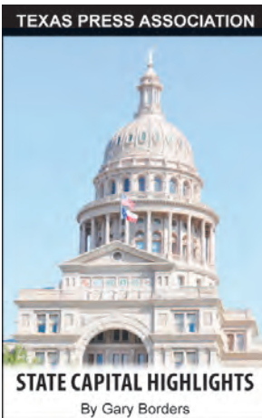
STATE CAPITAL HIGHLIGHTS By Gary Borders

There was only one violent incident reported at the polls, when a man punched an election worker in Bexar County after being asked to remove his Trump hat.