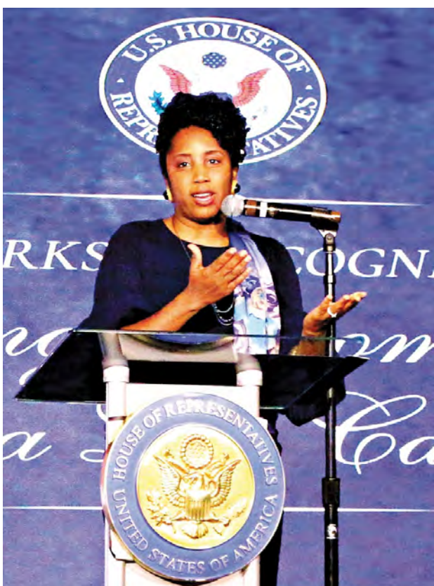
Congresswoman Erica Lee Carter addresses the attendees at her community swearing in ceremony. She pledged to speak truth to power and to continue the legacy of her mother, the late Sheila Jackson Lee.

Her current term ends on January 3, 2025.