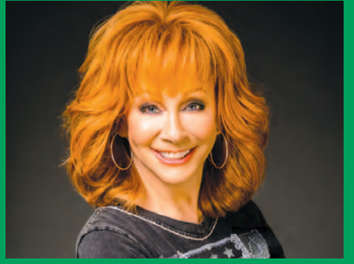
Reba McEntire Opens at Houston Rodeo on Tuesday, March 4.