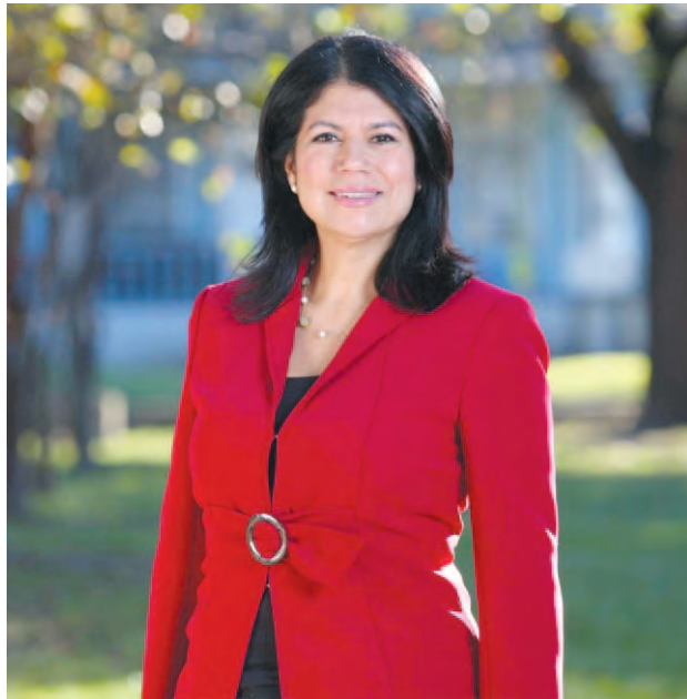
Texas State Senator Carol Alvarado

This session, she was appointed to the Senate Committee on Finance, Senate Committee on Economic Development, Senate Committee on