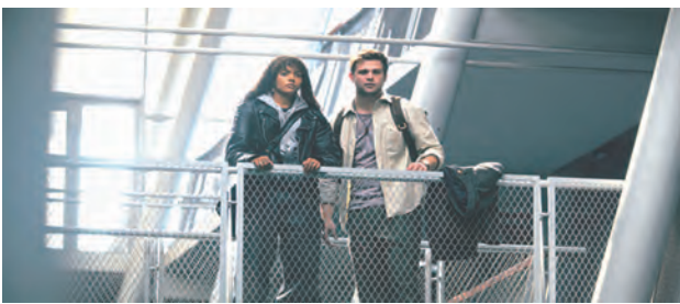
Quintessa Swindell, left, and Leo Woodall star.