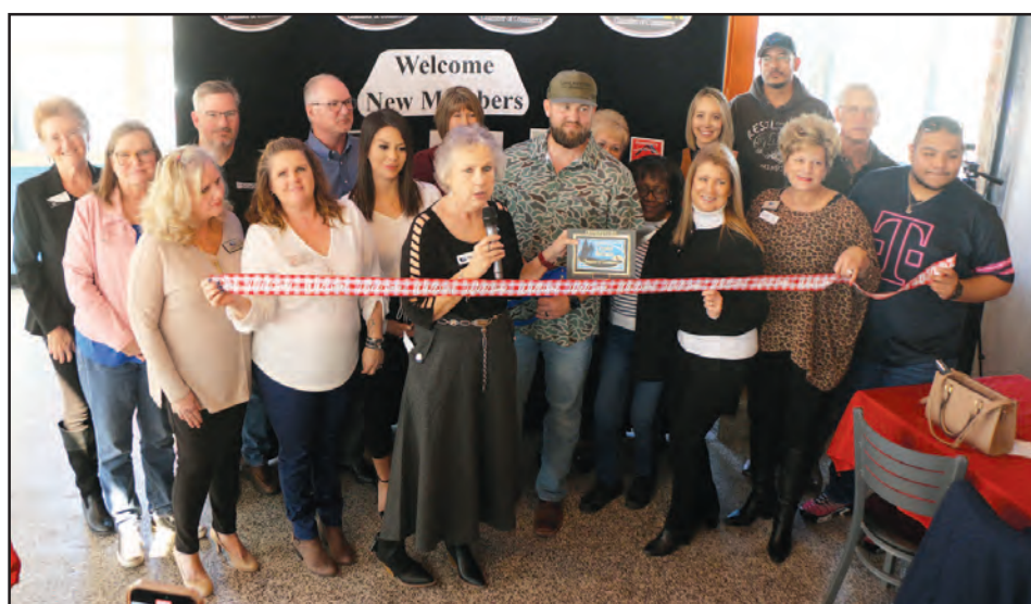
The Crosby-Huffman Chamber of Commerce celebrated the ribbon cutting with the Lake Houston Brewery in Huffman on Thursday. The members also had lunch at the restaurant and tasted the many delicacies.