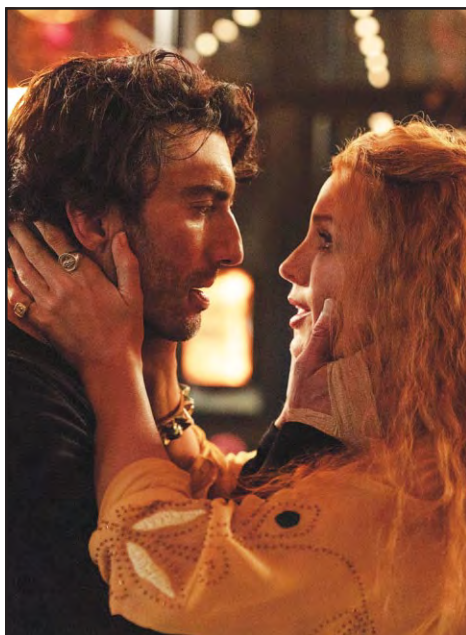
Justin Baldoni and Blake Lively in "It Ends with Us"

*** Sebastian Stan was another Globe winner for "A Different Man" (which he also produced), but the film only grossed $1.3