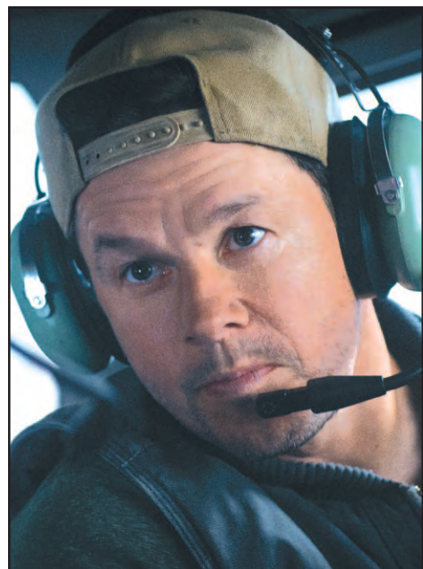
Mark Wahlberg star in Mel Gibson's "Flight Risk" (1973)

Wahlberg told People magazine that the best part about his temporary look was seeing his wife's face the first time he took off his hat. The movie, which was directed by Mel Gibson and also stars Michelle Dockery ("Downton Abbey"), was originally set for release in 2024 but got moved back to Jan. 25.