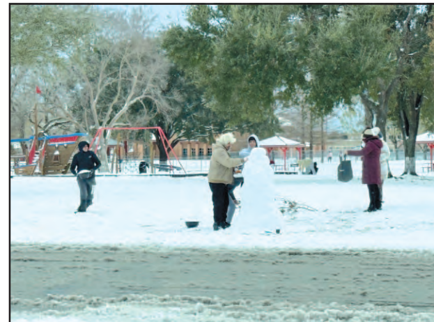
Galena Park residents building a snowman at the GP Park.

then collided with a low-pressure system near the Gulf Coast that brought the precipitation onshore turning it into a wintry mix of sleet and snow.