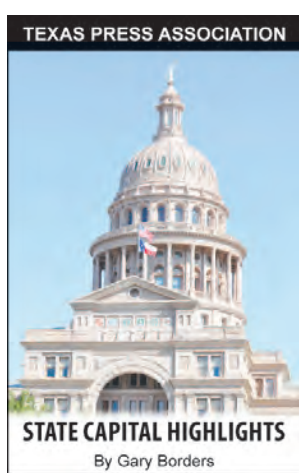
STATE CAPITAL HIGHLIGHTS By Gary Borders

The News reported that the official recommendation of a reservoir project in no way guarantees its construction. The permitting process at the