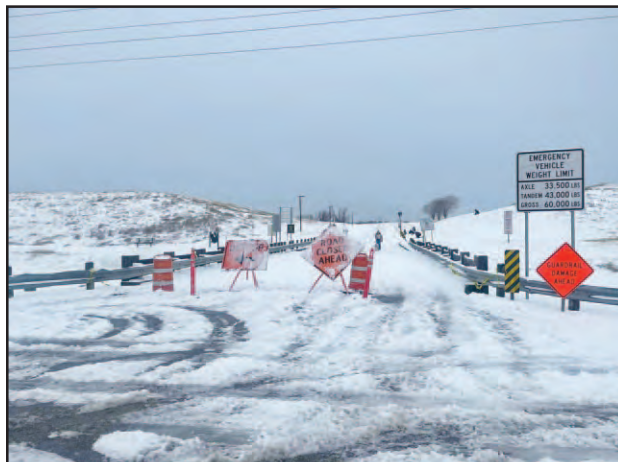
Galena Park, Main st. at rail tracks closed due to icy conditions.

The rare snow days paralyzed the entire Gulf Coast with school closures,