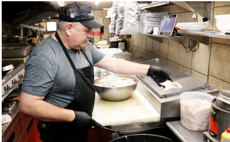
Chefs are known for their catfish delicacies prepared fresh daily at the restaurant.