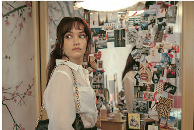
Olivia Cooke stars in "The Girlfriend."