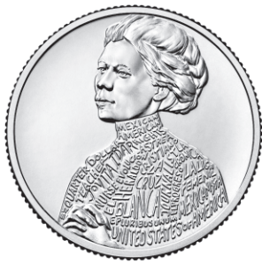
The Jovita Idar U. S. Quarter honoring the trailblazing who devoted her life to fighting separatist ideologies.