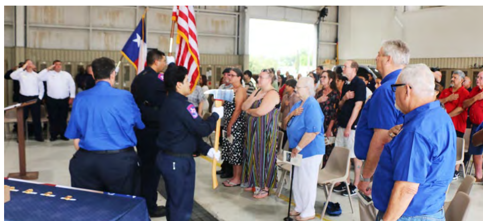
The firehouse was full of friends, family members, and fire personnel for the badge pinning ceremony at ESD 12.